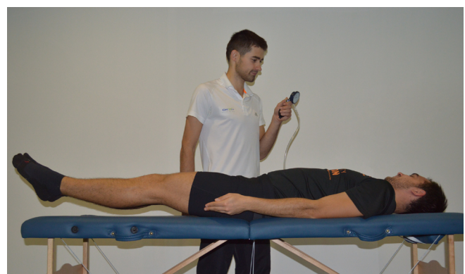
Figure 3. Double straight leg lower test.

were in a supine position, with the stabilizer PBU (Figure 1) placed under the lumbar section, with its centre at L3. When the lumbar section was in a neutral position, the PBU was pumped to 40 mm Hg. Next, from the starting position